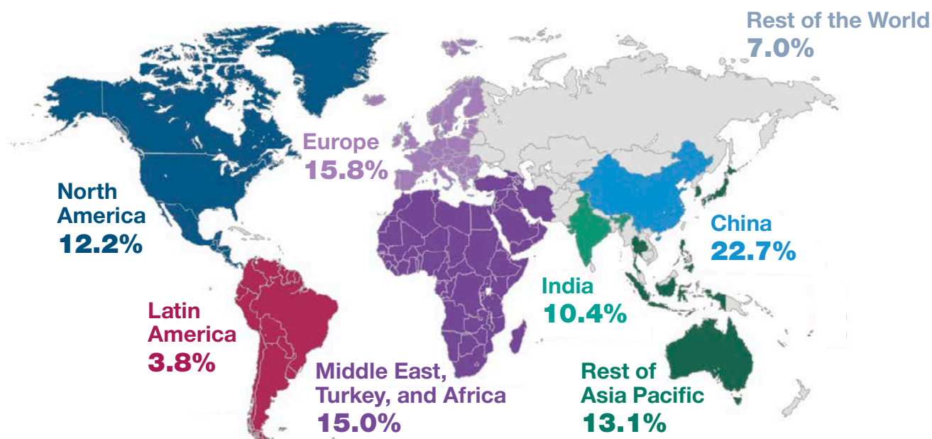
(Fig. 2) Share of green energy investment in new capacity 2020–2050E